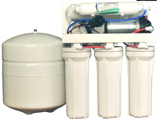
Booster Pump Model Shown Above

The DWSB Series Reverse Osmosis Drinking Water System reduces harmful contaminants and turns common tap water into the fresh, quality water that nature intended us to drink. A 5-stage system filters water at the molecular level. Drawn water passes through a final carbon filter to remove any unwanted tastes or odors. The result is simply healthier, better tasting water.